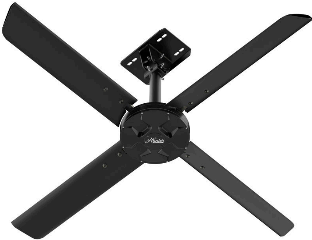
(XP 8FT Fan pictured above)