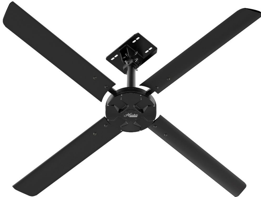
(XP 8FT Fan pictured above)