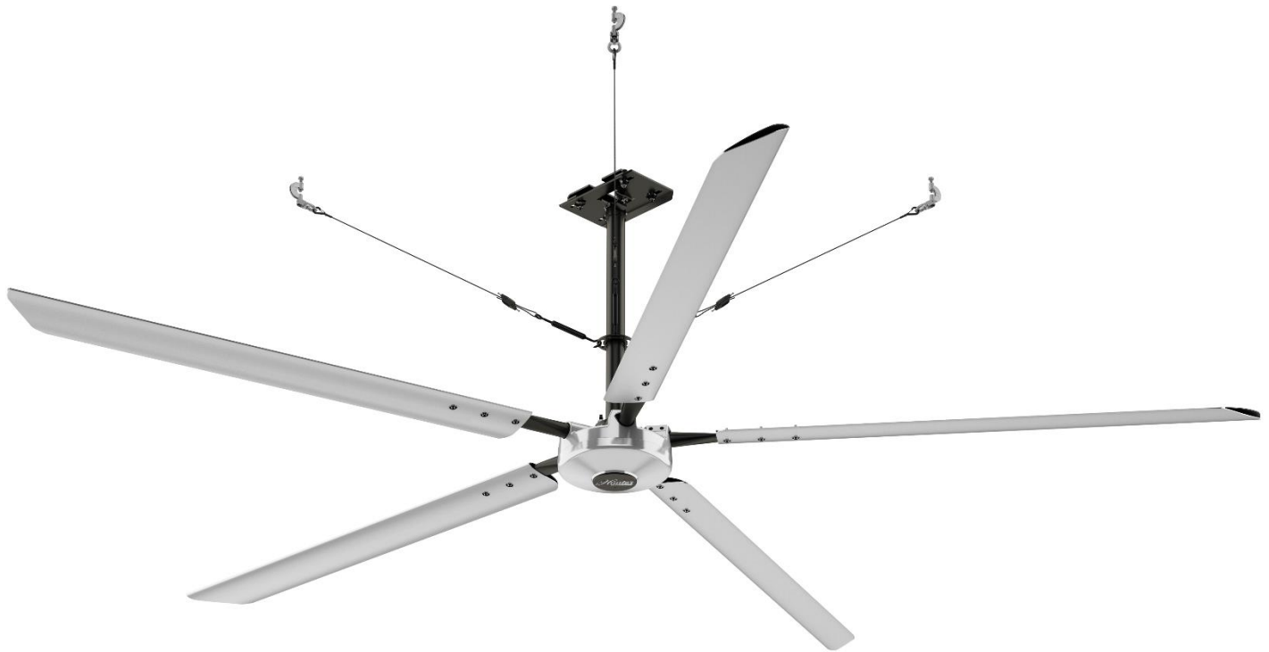
(TITAN 14FT Fan pictured above)