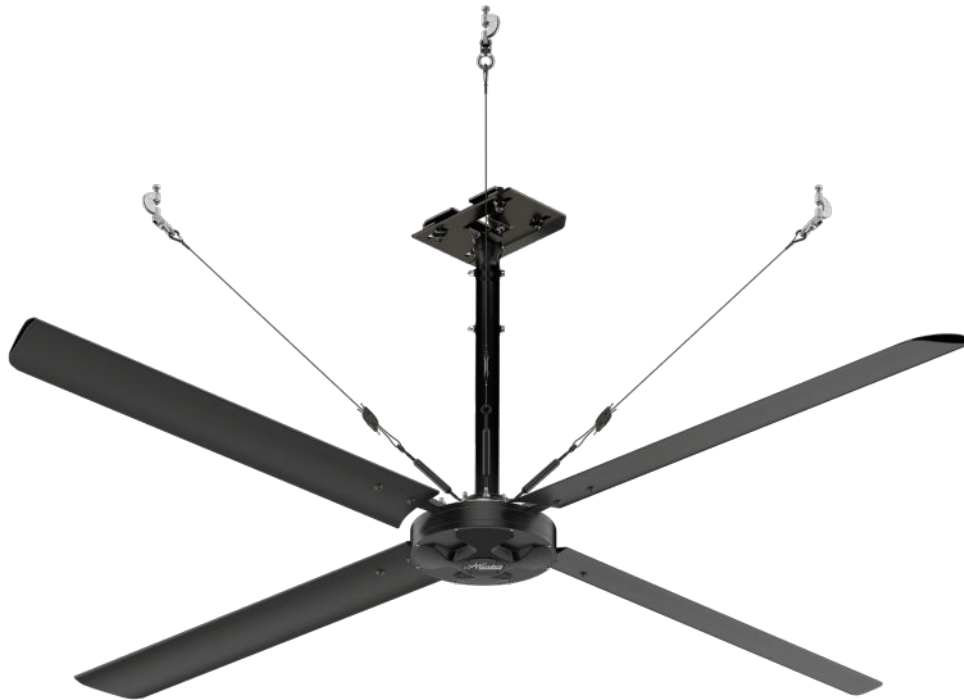
(ECO 10FT Fan pictured above)